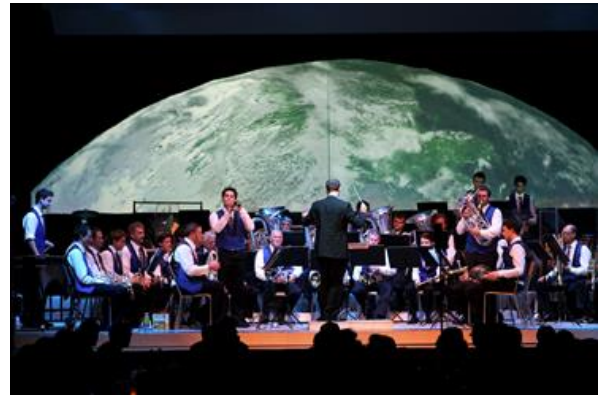
Brass Band MG Oberrüti

Saturday, 10 th - Opening Ceremony at Huaihai Road Sunday, 11 th - Huajing Park (15:00 - 15:30) Monday 12 th - Oriental Pearl TV Tower (16:30 - 17:00) Tuesday, 13 th - Nanjing Pedestrian Street (15:00 - 15:30)